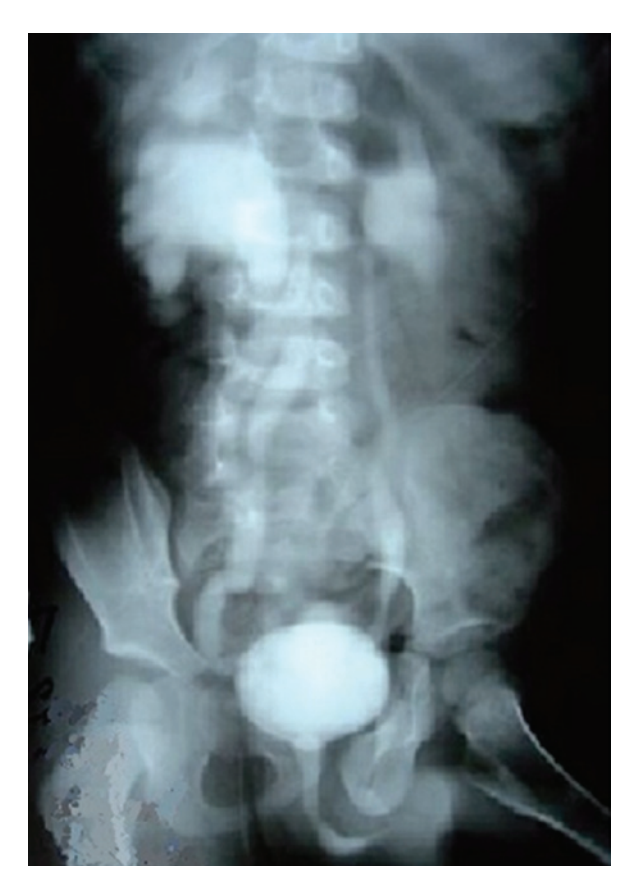
Fig. 3. Miction cistogramma patient m., 2 years 11 months. Is an active 2-way VUR III-V