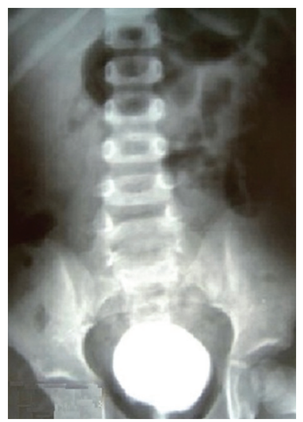
Fig. 4. Miction cistogramma the same patient after 6 months after surgery. VUR is not defined

endoscopic correction depends on the degree of reflux and primary treatment. The application of endoscopic correction methods allows to achieve a positive result of treatment of VUR in 95,7% of the cases, that allows to consider them to be the method of choice for carrying primary surgical treatment of this pathology.