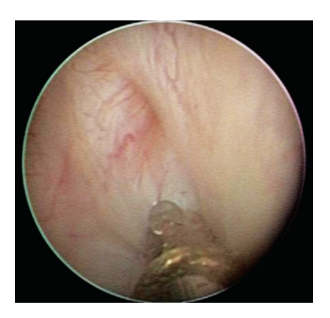
Fig. 2. The mouth of the ureter after the introduction of the gel VANTRIS

industry of water indexes pulsational (Pi) and resistance (Ri) showed numbers not exceeding the norm: Pi 1,11±0,26, Ri 0,68±0,13. Depletion of intrarenal vascular figure as one of the signs of the secondary wrinkling of the renal parenchyma was not observed.